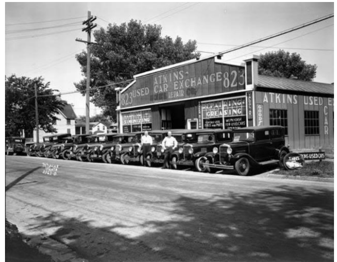
Atkins Used Cars Exchange I wonder is the 823 on the building a street number or a phone number.

Leave from Mt. Comfort Methodist Church, 3179 N 600 W, Greenfield, IN 46140 @ 10:00 AM (Tim H. Phone 317-767-1135).