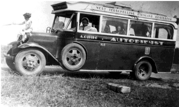
1931 Model A Ford Bus No6. Note the hood ornament.