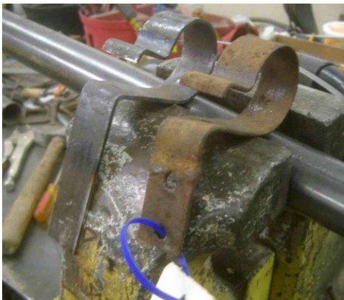
Muffler outlet pipe bracket for the AA trucks.