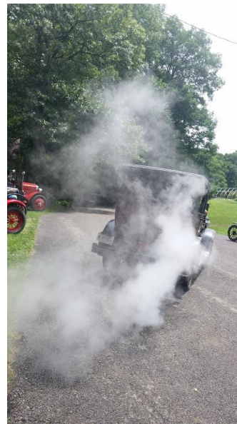
Shutting the Steamer down.

Stanley Steamer and Old Trucks tour. I can now check one more thing off of my Bucket List. I got to ride in a 1921 Stanley Steamer.